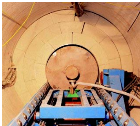
Figure 1: FEBEX - EBS emplacement. Steel canister, in the centre, is pushed into the bentonite backfill (note blocks of compacted used in this case)

The differences between the aims and boundary conditions for Phase VI (2003 – 2013) compared to previous phases of work can be illustrated by considering some of the experiments involved. One of the most successful of GTS projects has been FEBEX (Full-scale Engineered Barrier Experiment; Ulibarri et al., 1996, ENRESA, 2000), carried by a multi-national team under the leadership of ENRESA and supported by the EU and the Swiss SER. Although initially focussed on examination of coupled thermal-hydraulic-mechanical-chemical processes in the near-field around packages of spent fuel, this project was extremely valuable in demonstrating the fundamental feasibility of – but the many practical problems associated with – emplacement of compacted bentonite buffer/backfill (Fig. 1).